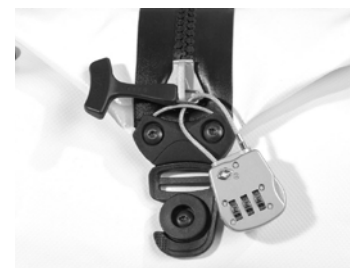
Wire loop for locking the bag with padlock (padlock not included)